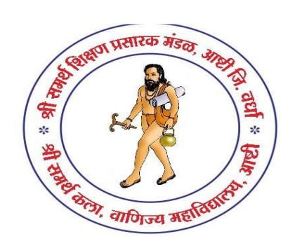
Shri Samarth Arts & Commerce College, Ashti Ashti - 442202 Dist.Wardha Estd. 1989